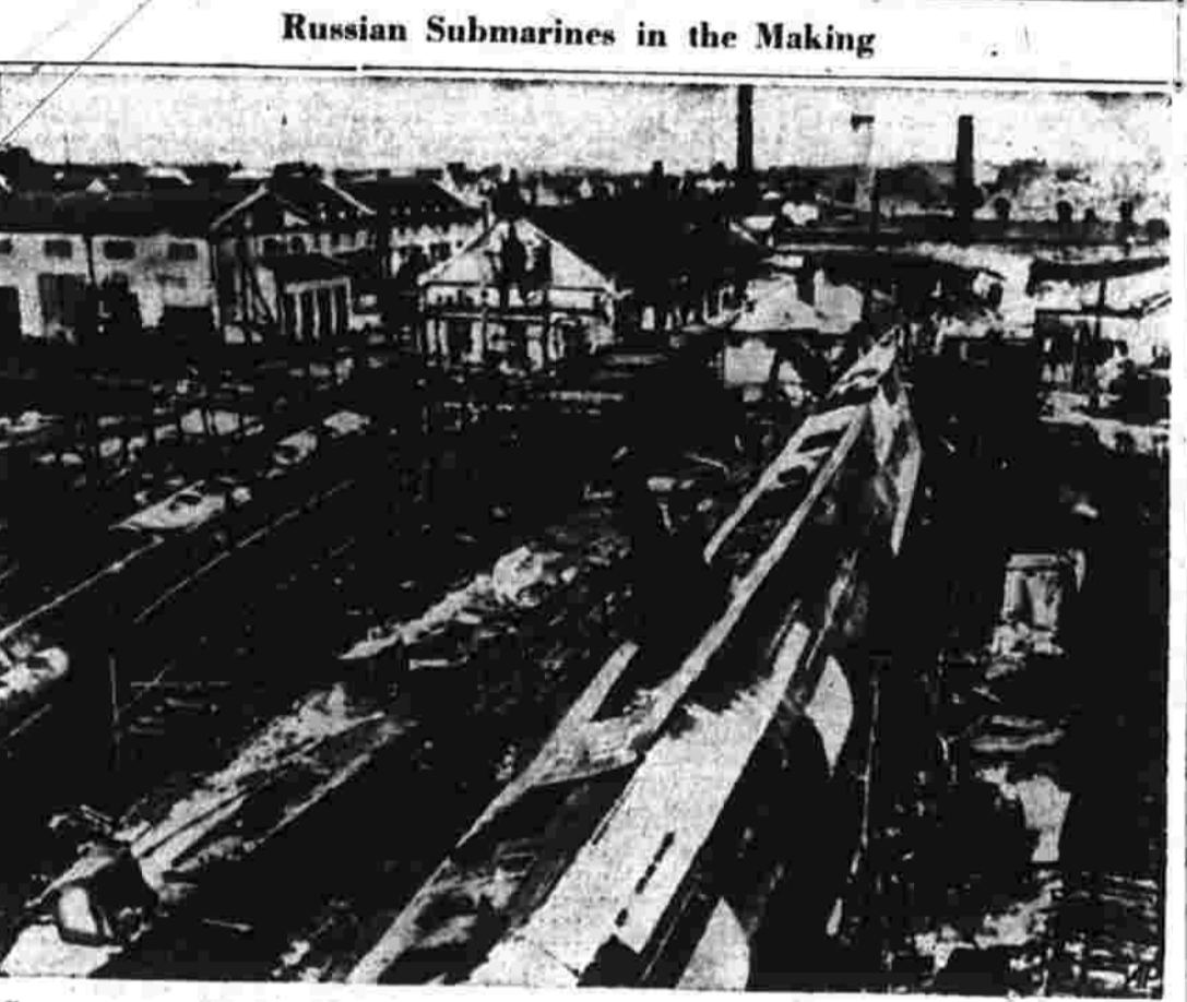
Russian Submarines in the Making

German sources describe this as a scene of Russian submarines on the ways in shipyards at Nikolayev, Black Sea naval base and industrial center. The Russians admitted the loss of Nikolayev August 18. This picture was transmitted by radio from Berlin to New York.